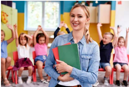
Teachers, Para's and Substitutes