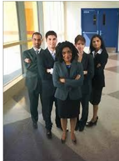
Principals, Deans, Counselors and other Administrative Adults