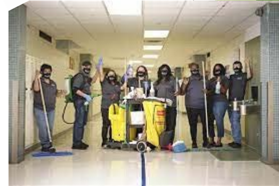
Custodians, Lunch Room Personal and Law Enforcement