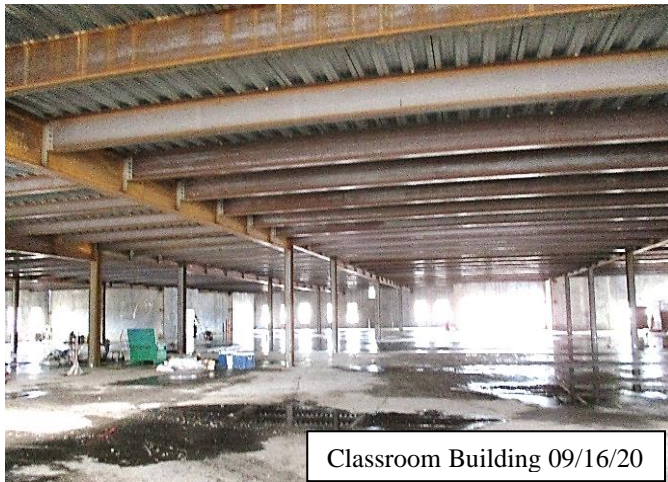
Classroom Building 09/16/20

Status/Comments: Storm and sanitary sewers and structural steel installation are ongoing. Watermain, ballfield and exterior lights, and asphalt pavement base work are progressing. The cafeteria building mechanical, electrical and plumbing rough-ins, steel studs and roofing installation are progressing.