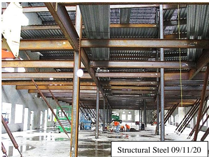
Structural Steel 09/11/20

Status/Comments: Storm and sanitary sewers, underground electrical and plumbing, and chilled water lines are progressing. Tilt panel formwork and erection of tilt panels and structural steel are progressing.