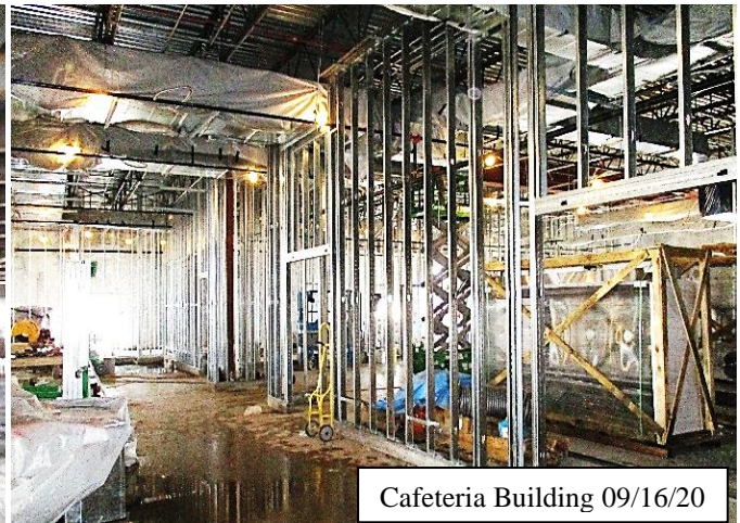
Cafeteria Building 09/16/20