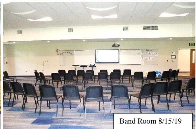
Band Room 8/15/19