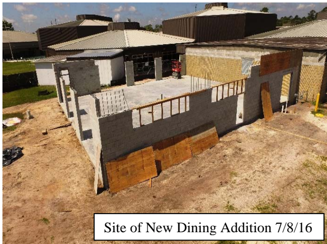
Site of New Dining Addition 7/8/16

Status/Comments: Dining expansion and kitchen renovation construction is on-going. Site work for the classroom addition is also on-going. Classroom addition plans are now 99% complete, with building construction set to start in July (building site work is currently underway).