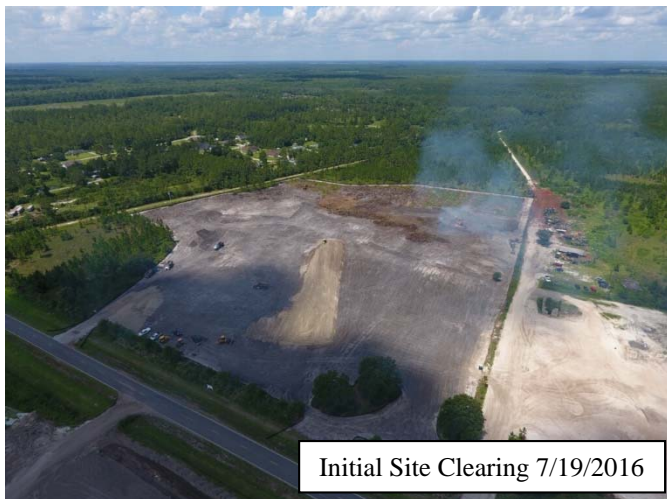
Initial Site Clearing 7/19/2016

Status/Comments: Initial clearing of the site for School “M” began on June 27 th with the property perimeter to allow the required silt fence to be installed.