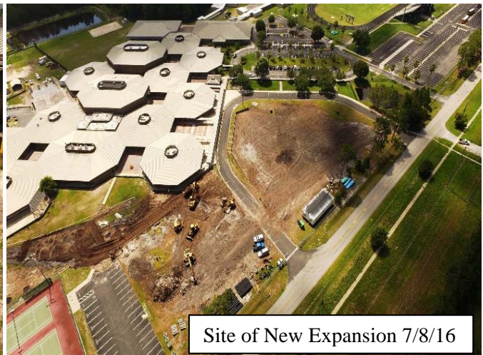
Site of New Expansion 7/8/16