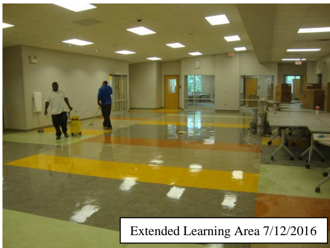
Extended Learning Area 7/12/2016

Status/Comments: Project is substantially completed. Furniture installation, punch list, and training of maintenance employees are all progressing.