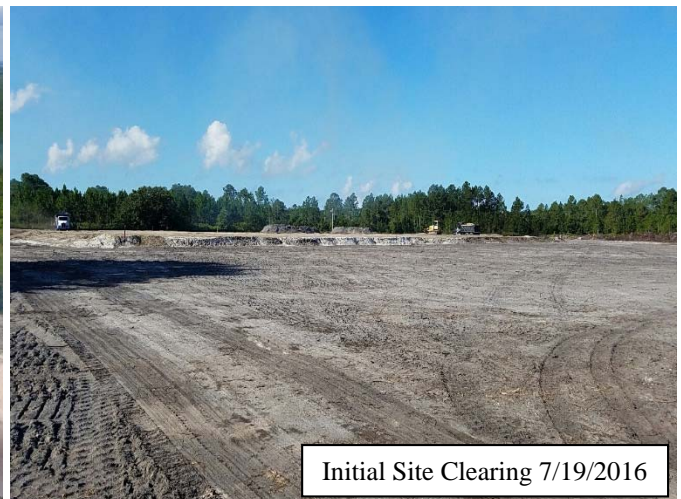
Initial Site Clearing 7/19/2016