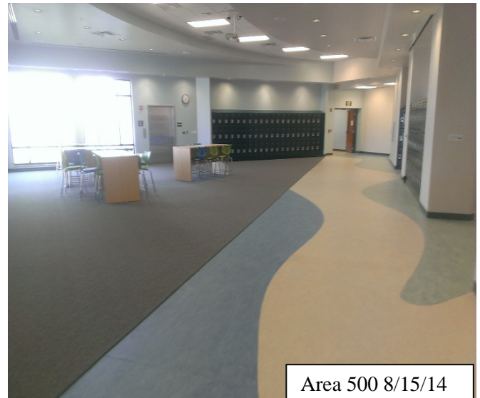
Area 500 8/15/14