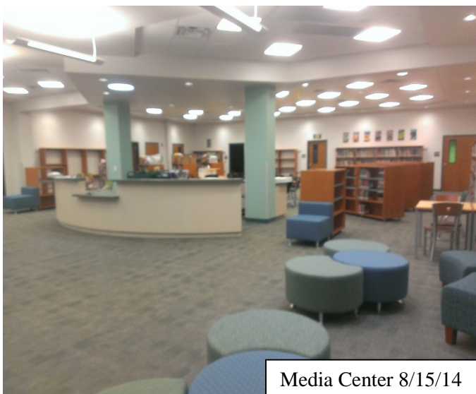
Media Center 8/15/14

Status/Comments: Staff and students have moved in for the new school year. Training of staff and maintenance personnel will continue with this new school. Punchlist items are being completed.