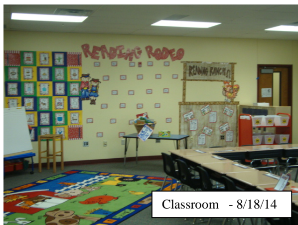
Classroom - 8/18/14

Status/Comments: Staff and students have moved in for the new school year. Training of staff and maintenance personnel will continue with this new school. Punchlist items are being completed.