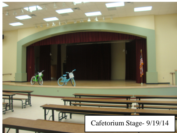
Cafetorium Stage- 9/19/14