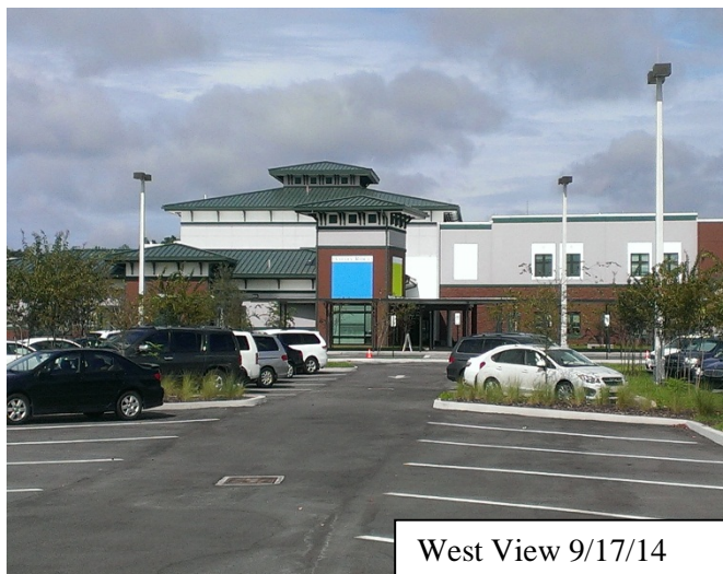
West View 9/17/14

Status/Comments: Training of staff and maintenance personnel will continue. Punch list items are being completed and final closeout is progressing.