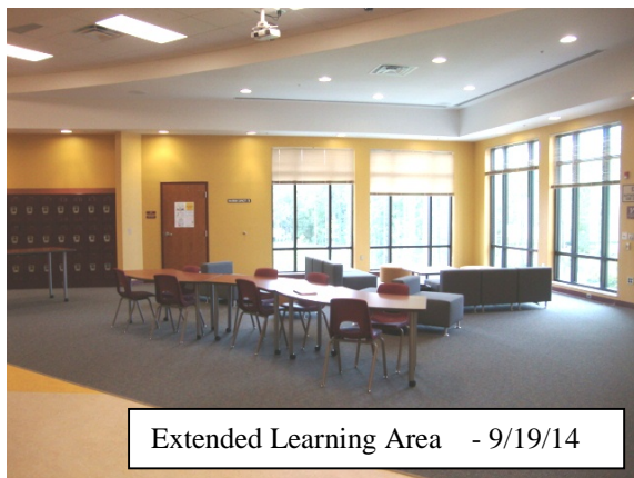
Extended Learning Area - 9/19/14

Status/Comments: Punch list items, training and closeout is progressing