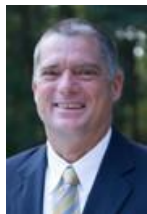
St. Johns County Superintendent of Schools