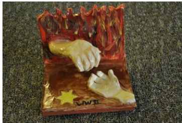
2011 winner Gitty Friedman, Grade 7 Lubavitch Education Center

Contest Dates: September 1, 2011 – May 4, 2012