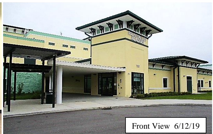
Front View 6/12/19