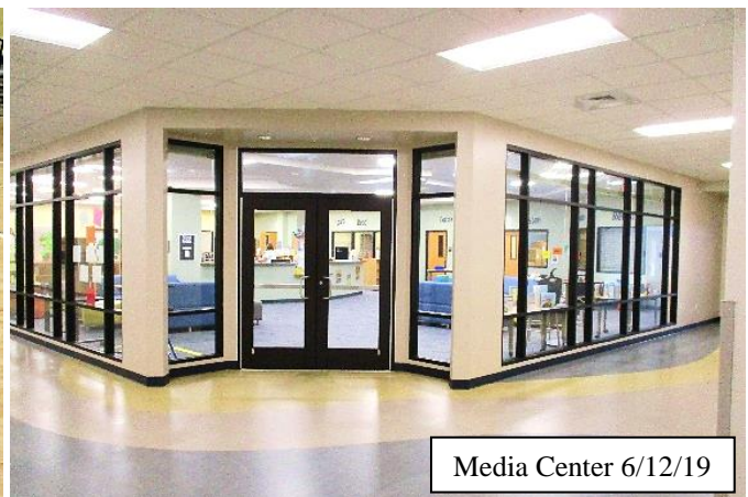
Media Center 6/12/19