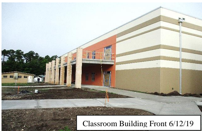
Classroom Building Front 6/12/19

Status/Comments: Paving is complete and final grading is progressing. All work above the ceilings and ceiling tile installation are complete. Carpet, LVT flooring, painting and lockers installation are complete in the classroom building. Casework, data, fire alarm, intercom and intrusion system, door and hardware installation and elevator installation are progressing.