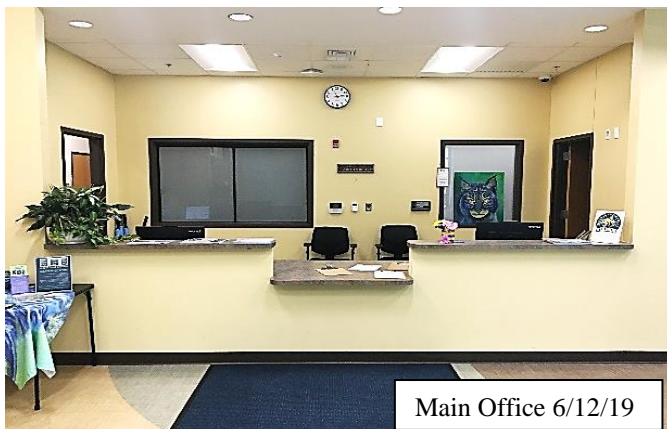
Main Office 6/12/19

Status/Comments: The punch list is ongoing.