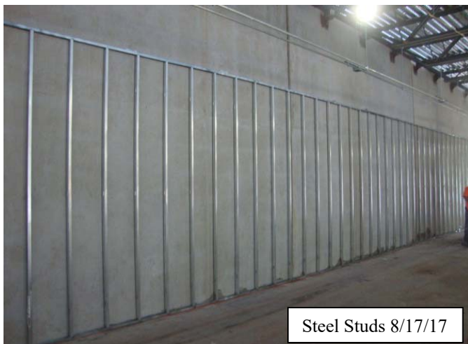
Steel Studs 8/17/17

Status/Comments: Erection of tilt panels in the main building is complete. Tilt wall erection for smaller ancillary facilities is progressing. Structural steel erection, lightweight concrete roofing, steel studs, mechanical, plumbing and HVAC installation are progressing.