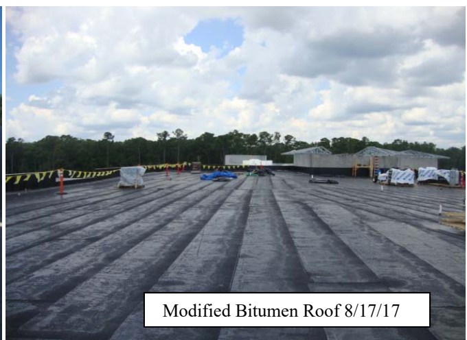
Modified Bitumen Roof 8/17/17