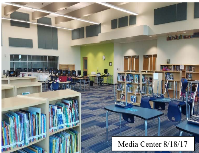
Media Center 8/18/17

Status/Comments: Picolata Crossing ES was substantially complete for early arrival of staff and then students on August 10, 2017. First day of school was very successful in all aspects. The punch list is ongoing.