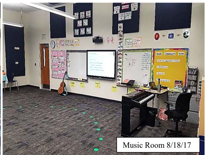
Music Room 8/18/17