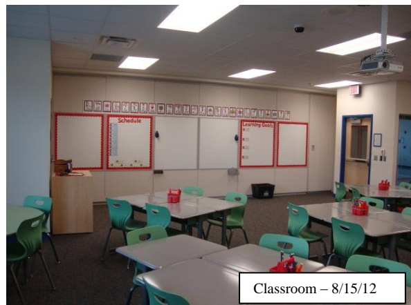
Classroom – 8/15/12

Change Order #1 included site related changes and owner direct purchases