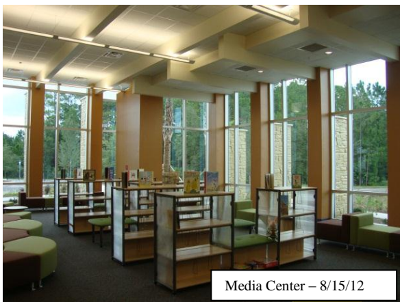
Media Center – 8/15/12

Status/Comments: A Certificate of Occupancy was issued on August 6, 2012. Students and Staff have occupied the school. Furniture and equipment installation is complete. Final minor punch list items are progressing.