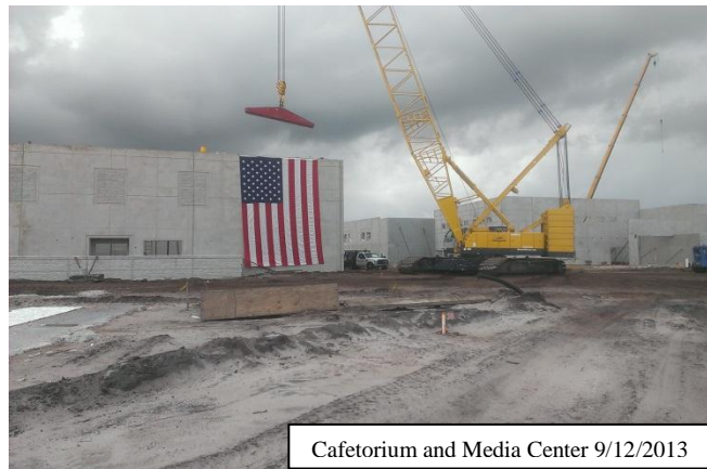
Cafetorium and Media Center 9/12/2013

Change Order #1 included only owner direct purchases