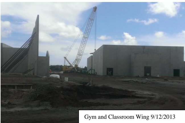
Gym and Classroom Wing 9/12/2013

Status/Comments: Site work, including parking, drives and curbs, installation continues. Concrete floor slab placement is 95% complete. Tilt wall panel construction is on-going, with erection of 60% of the panels complete. Roof installation is progressing for the gymnasium and cafetorium areas.