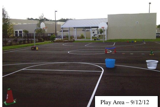
Play Area – 9/12/12

Change Order #1 included site related changes and owner direct purchases