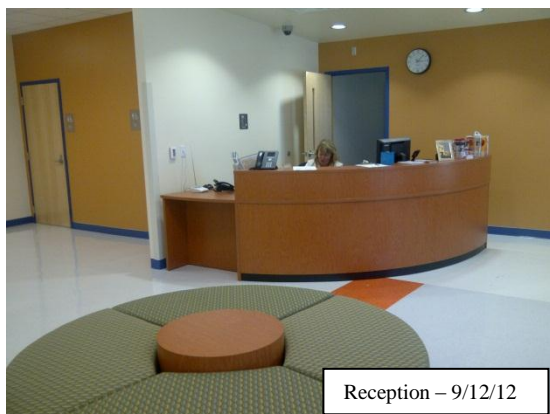
Reception – 9/12/12

Status/Comments: Construction is complete. Administrative close-out procedures are progressing.