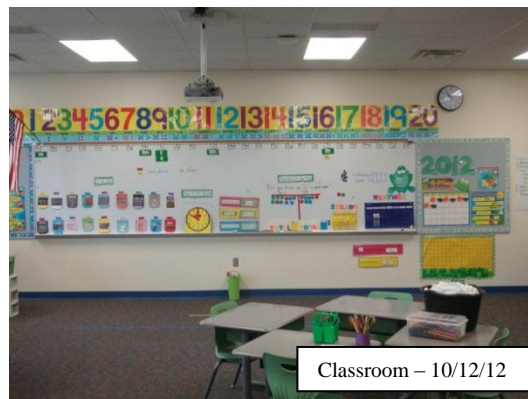
Classroom – 10/12/12

Change Order #1 included site related changes and owner direct purchases