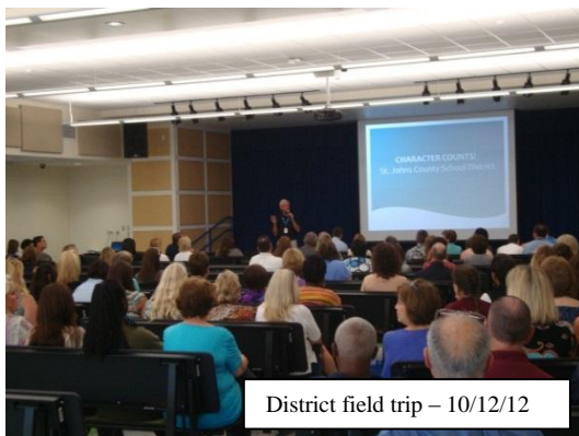
District field trip – 10/12/12