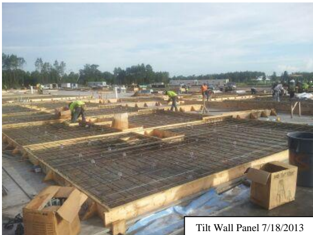
Tilt Wall Panel 7/18/2013

Status/Comments: Site work, including underground utilities installation, is on-going. Building footings are complete. Concrete floor slab placement is 85% complete. Tilt wall panel construction has commenced.