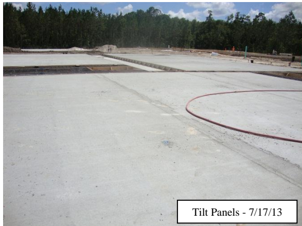
Tilt Panels - 7/17/13

Status/Comments: Fill for parking areas and around remainder of the site is progressing. Footings, site utilities, plumbing, underground HVAC piping and electrical rough-ins are progressing. Slab on grade is completed. Work on forming and pouring of tilt panels are progressing.