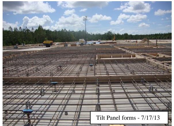
Tilt Panel forms - 7/17/13

Change Order#1 included site related changes and owner direct purchases