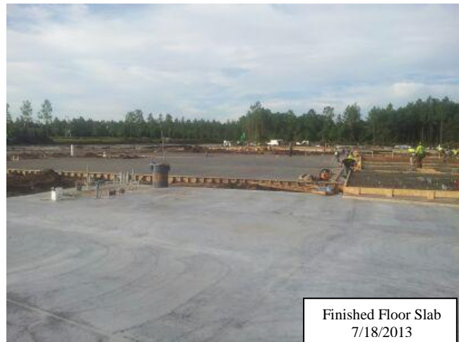
Finished Floor Slab 7/18/2013