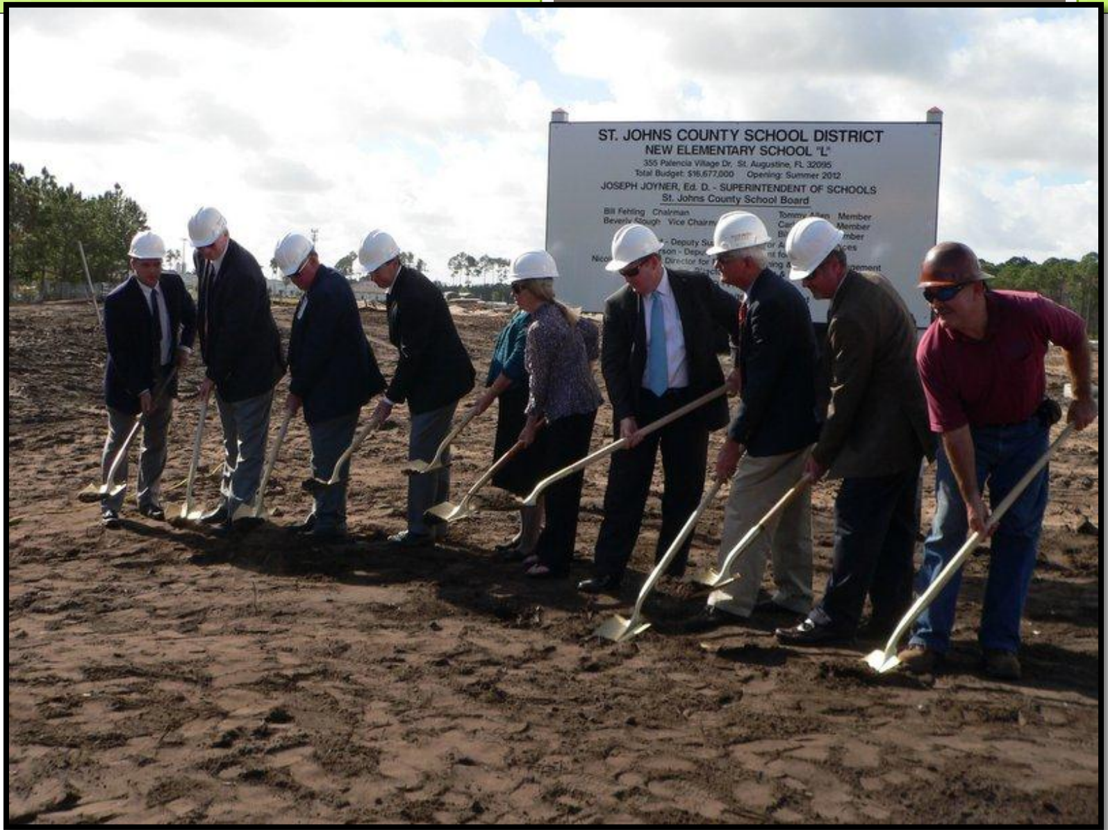
Groundbreaking with Board Members and District Staff