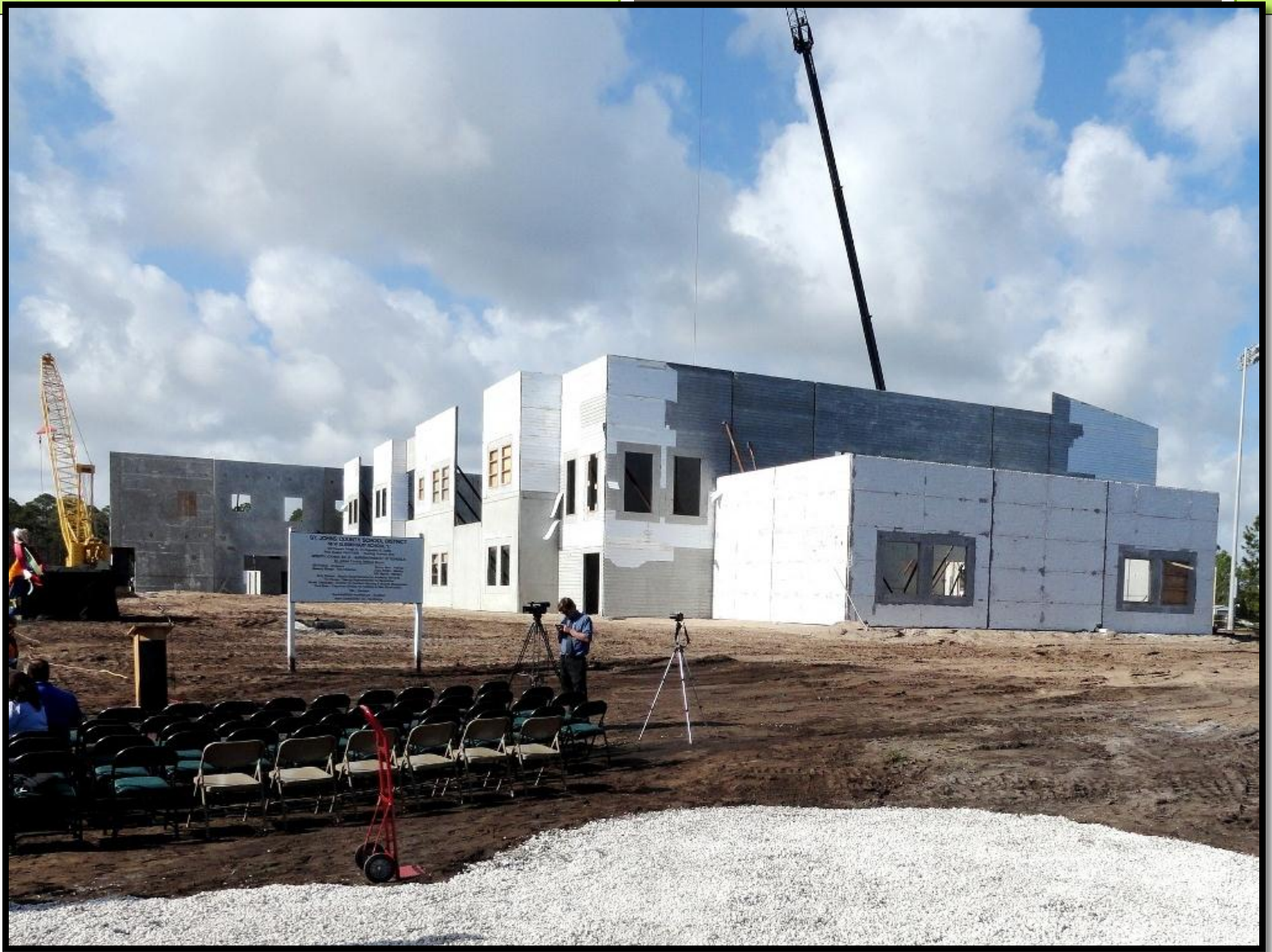
Elementary School "L" as of 12-5-11